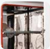
Stainless Steel Inner CaVity