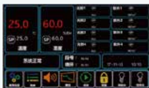
Operating Main Interface