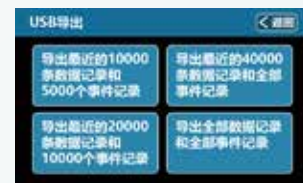
USB Export Interface